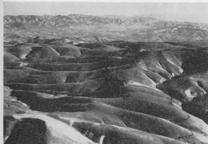
An aerial view of the Wilderness of Judaea to the east of Jerusalem showing the semi-arid terrain of eroded limestone and desolate plains. Both here and in deserts farther to the south many Jews from time to time sought refuge from their oppressors.

Jonathan and Bacchides (160-153 B.C.) . Bacchides' policy was clear—to suppress all resistance by force. Certain of Judas' friends were captured, tortured, and put to death; many others escaped into the desert of Judaea, where they went into hiding. By popular acclamation Judas' younger brother Jonathan was now elected leader in his stead, with the purpose of carrying on the war against the enemy (cf. 1 Macc. 9 23-31 ). Bacchides prepared against future trouble by holding certain leading Jews as hostages in the Akra and by building a ring of fortifications round Jerusalem (cf. 1 Macc. 9 50-53 ). In the spring of that same year (159 B.C.) Alcimus tore down the wall separating the Temple Mount from the inner court that had previously been forbidden to Gentiles; and when, a short time later, he died, the orthodox Jews regarded this as a just retribution. No suitable man was found to take Alcimus' place and the office of High Priest remained vacant for the next seven years (cf. 1 Macc. 9 54-57 ). Following the death of Alcimus, Bacchides decided he could safely leave his command in Judaea and so