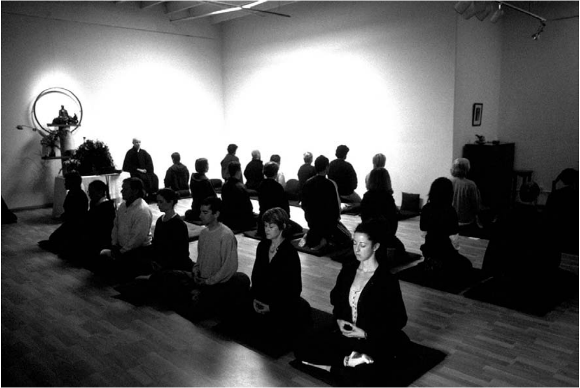
Figure 15. Zazen at the Santa Monica Zen Center, California.