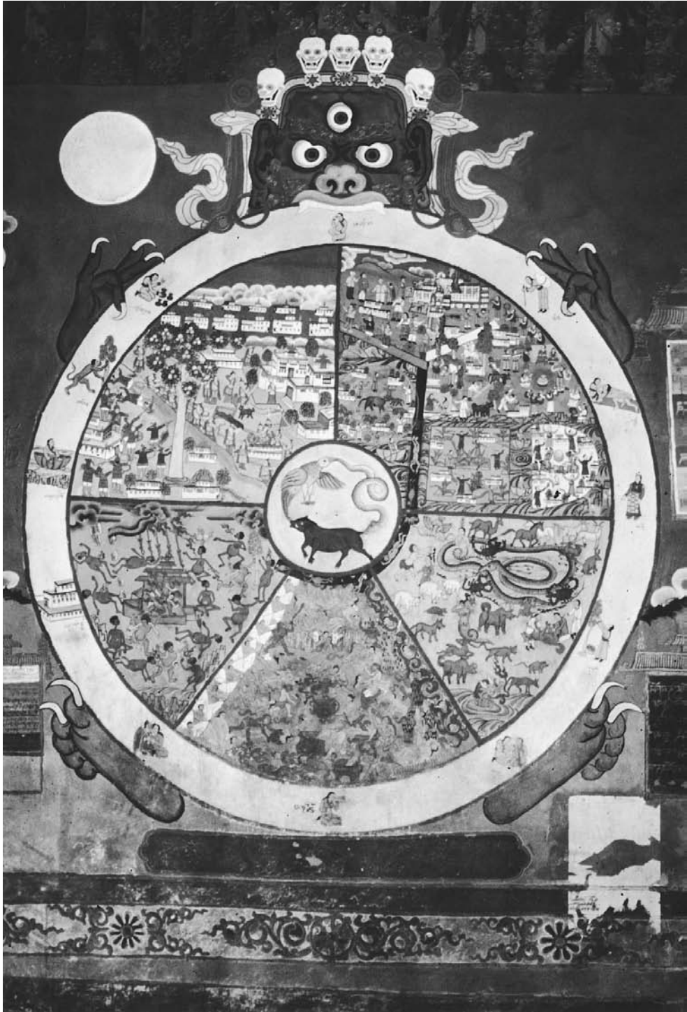
Figure 11. The Lord of Death clutches the round of rebirth in a mural at Thiksé Monastery, Ladakh.