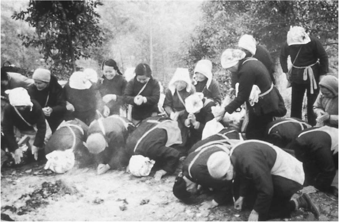
Figure 10. Worshipers at a roadside shrine to Kuan-yin in Hangchow, China.