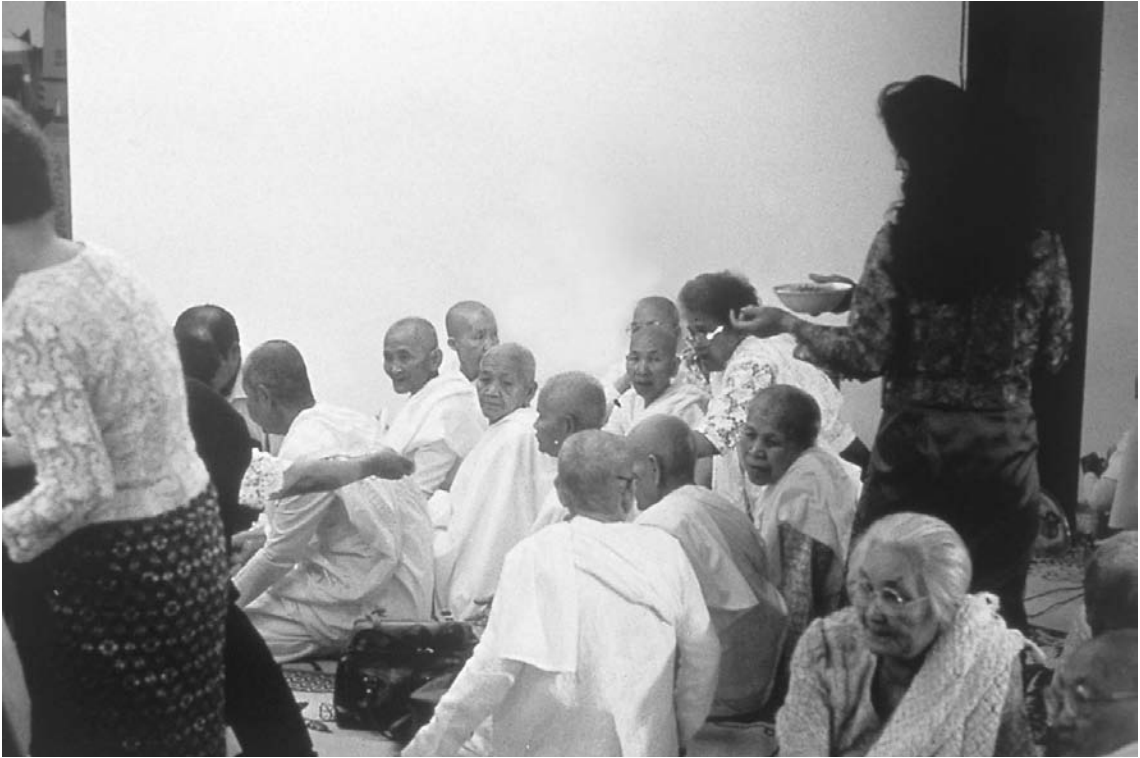
Figure 6. Cambodian nuns clad in white attend a new robes ceremony for fully ordained Theravada monks.