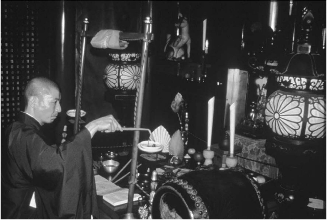
Figure 13. A Japanese monk prepares to conduct a ritual at a shrine.