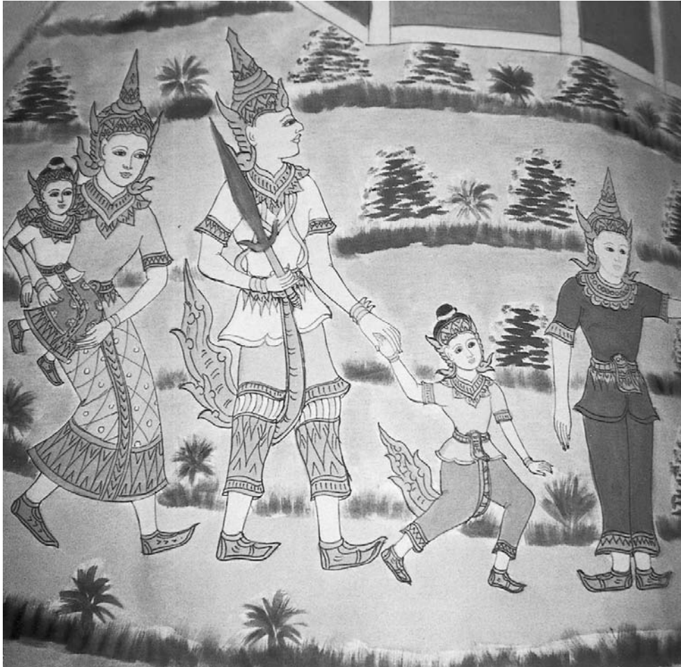
Figure 4. A scene from the Vessantara Jataka in which Prince Vessantara, Maddi, and their two children walk to their forest hermitage. A mural from Wat Luang monastery in Laos.