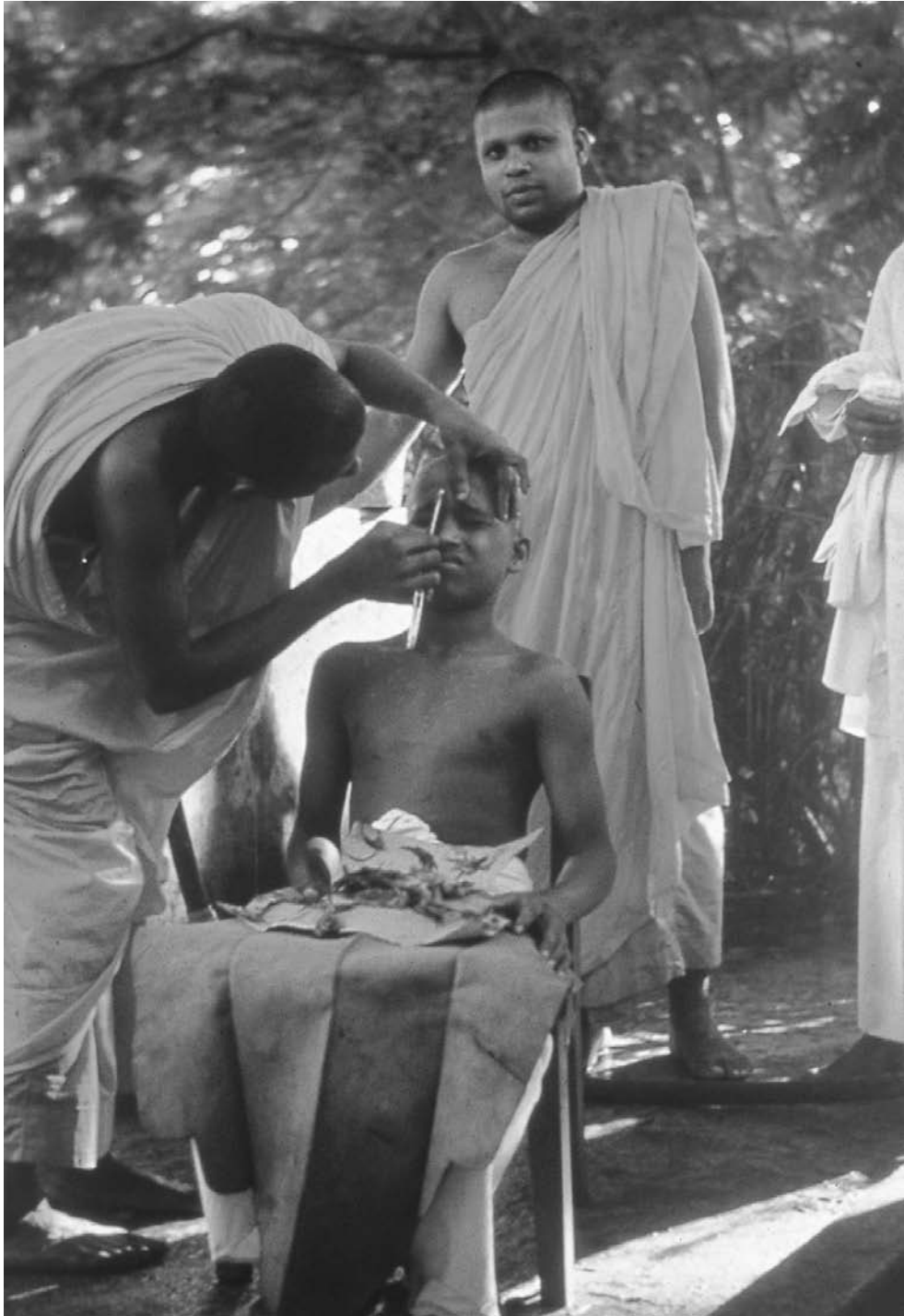
Figure 5. A novice ordination ceremony in Sri Lanka.