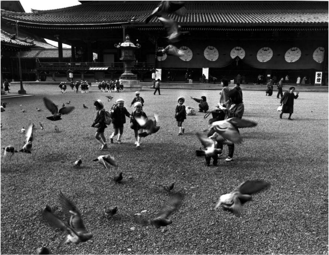
Figure 1. Higashi Hongwanji Temple in Kyoto, Japan.