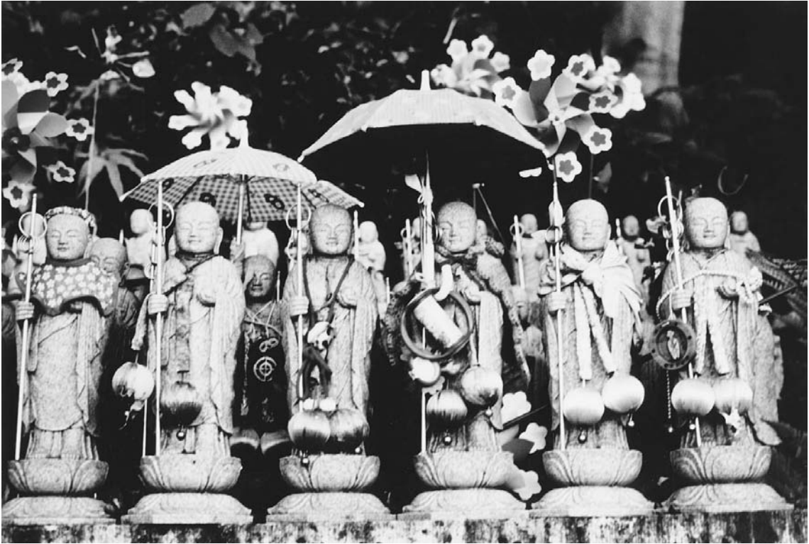
Figure 14. Stone images representing Bodhisattva Jizo and aborted infants at Purple Cloud Temple, Chichibu, Japan.