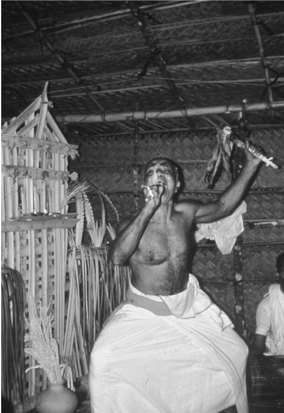
Figure 12. A yakedura in trance (Sri Lanka).