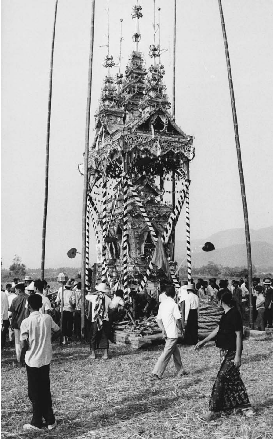
Figure 9. The cremation of a senior monk, Mae Sariang district, Mae Hong Son province, northern Thailand (edifice with the corpse of the senior monk situated at the site of the cremation).