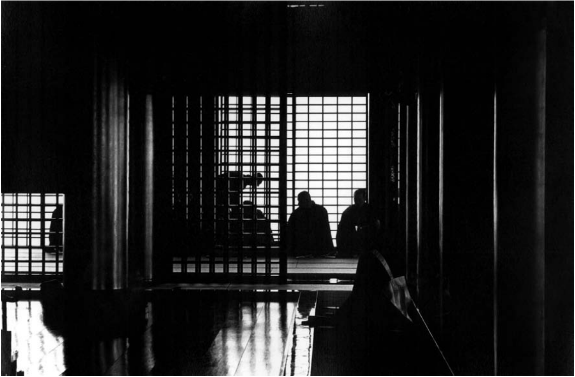
Figure 7. Inside a Shingon temple in Koyosan, Japan, the headquarters for Shingon Buddhism.