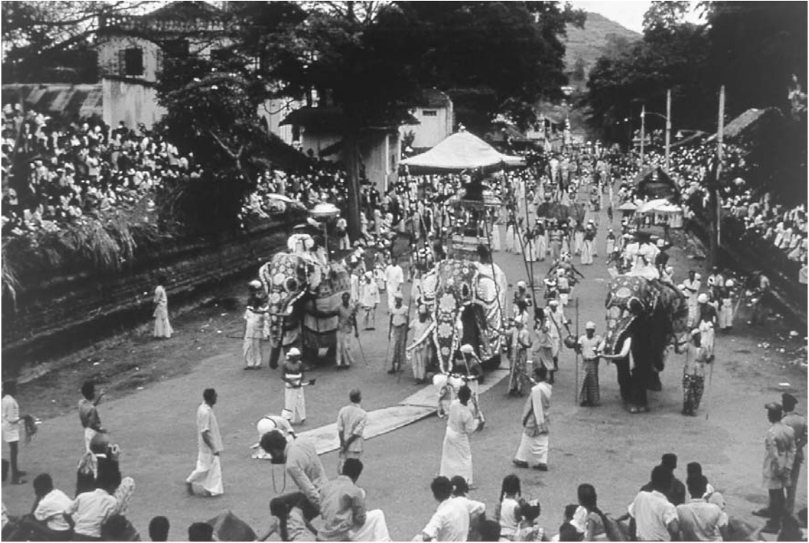
Figure 3. The procession of the Buddha's tooth relic in Sri Lanka.